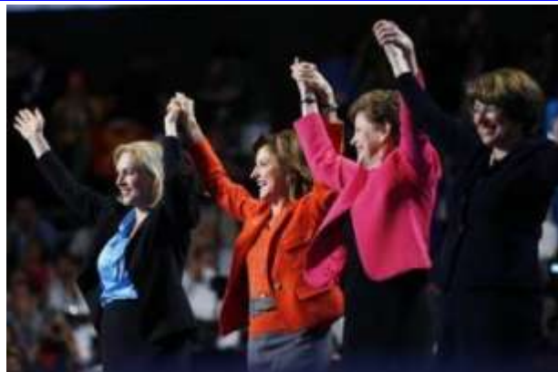
United States of America Congresswomen.

Perhaps Republicans believe women have already achieved equal footing with men, and there is no need for more women to be elected to Congress. Democrats, on the other hand, may believe both that women have fewer opportunities than men and that it is important for them to be elected to Congress. The vast majority of women who have been elected to the House and Senate are Democrats. What is your opinion?