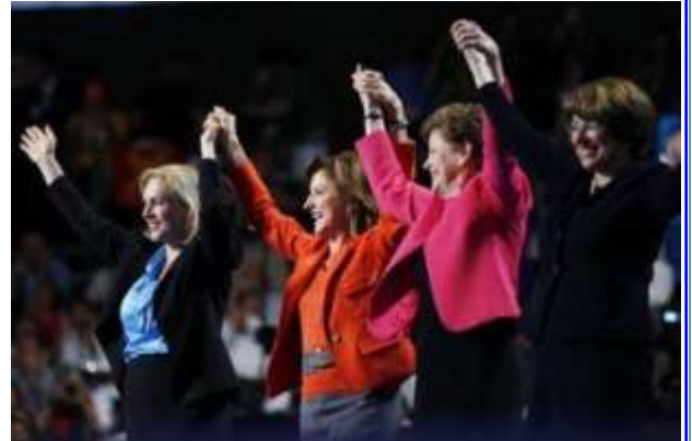
United States of America Congresswomen.

Perhaps Republicans believe women have already achieved equal footing with men, and there is no need for more women to be elected to Congress. Democrats, on the other hand, may believe both that women have fewer opportunities than men and that it is important for them to be elected to Congress. The vast majority of women who have been elected to the House and Senate are Democrats. What is your opinion?