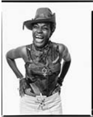
FLORYNCE "FLO" KENNEDY THE LIFE OF A BLACK FEMINIST RADICAL